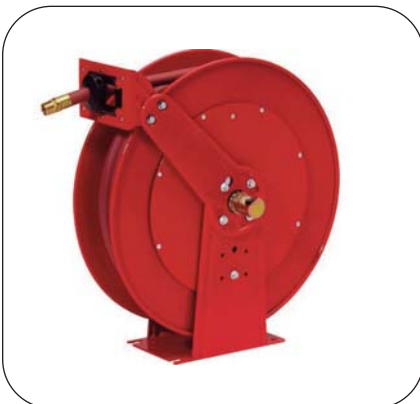
Thorburn's THRCs Coated Carbon Steel Spring Rewind Hose Reel

Constructed from premium SS 304 stainless steel with an advanced electrochemical finish, Thorburn's THRS4 is purpose-built for clean and sanitary applications. It offers exceptional corrosion resistance, durability, and a smooth, hygienic surface that withstands frequent washdowns and high-moisture conditions. Ideal for food & beverage processing, pharmaceutical facilities, and other hygiene-critical indoor environments.