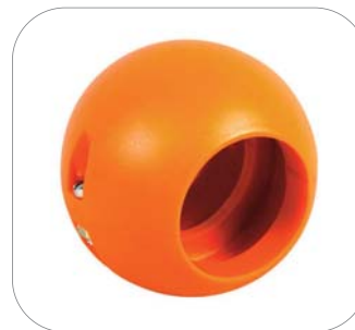
Rubber Hose Stopper Included