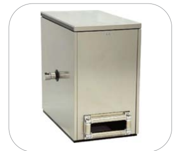
Protective Hose Reel Cabinet Available (See next page for details)