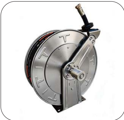
Thorburn's THRS4 Stainless Steel Spring Rewind Hose Reel

Thorburn Series THR utility hose reels are engineered for dependable handling of air, water, hydraulic fluids, and grease, delivering efficient, long-lasting hose management across demanding industries. A fully enclosed drive spring shields internal components from contaminants, ensuring smooth, consistent retraction with minimal maintenance. For enhanced safety, the reel features an adjustable cushion stop to lock the hose at the desired length, while multi-position guide arms allow flexible installation on walls, ceilings, floors, or service vehicles. By reducing hose wear, minimizing trip hazards, and keeping workspaces organized, Thorburn's THR hose reels help improve overall productivity and safety.